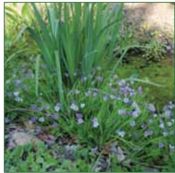
Blue eyed grass and Blue flag Iris.

A rain garden can be part of your landscaped yard by removing sod and adding plants to a depressed area designed to capture and retain