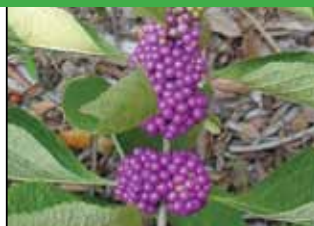
Beautyberry Callicarpa americana 4-6 feet high x 4-6 feet wide