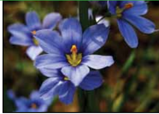
Blue eyed grass Sisyrinchium angustifolium 2 feet high x 1-2 feet wide