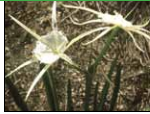
Spider lily Hymenocallis palmeri 3 feet high x 3 feet wide