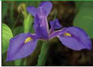
Blue flag Iris Iris hexagona 4 feet high x 3-5 feet wide