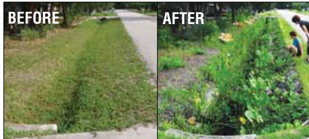
Brochure cover image, at right, shows the completed bioswale.

A bioswale is not usually mowed; it acts as a retention area or flow-through filtration garden. Provide regular maintenance by hand to maintain drainage, manage plants, and remove weeds.