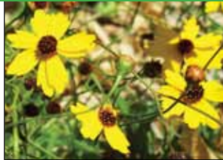
Common tickseed Coreopsis leavenworthii 1-3 feet high x 1-3 feet wide