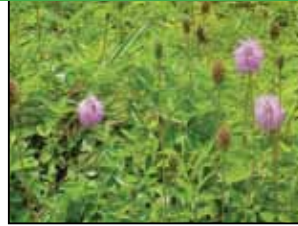
Sunshine mimosa Mimosa strigillosa Turf Replacement 1-3 inch spread