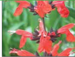
Tropical sage Salvia coccinea 1-2 feet high