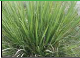
Dwarf Fakahatchee Tripsacum floridanum 4 feet high x 4-6 feet wide